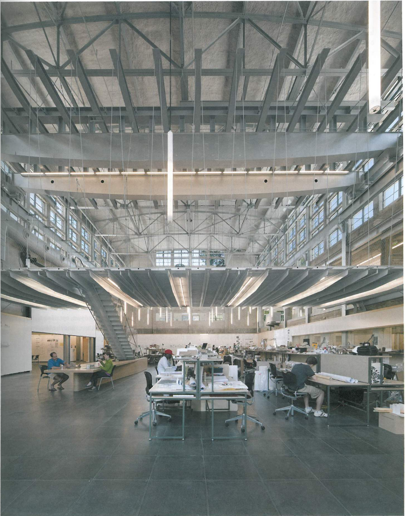
Figure, Phenomenality, and Materiality in the Hinman Studio