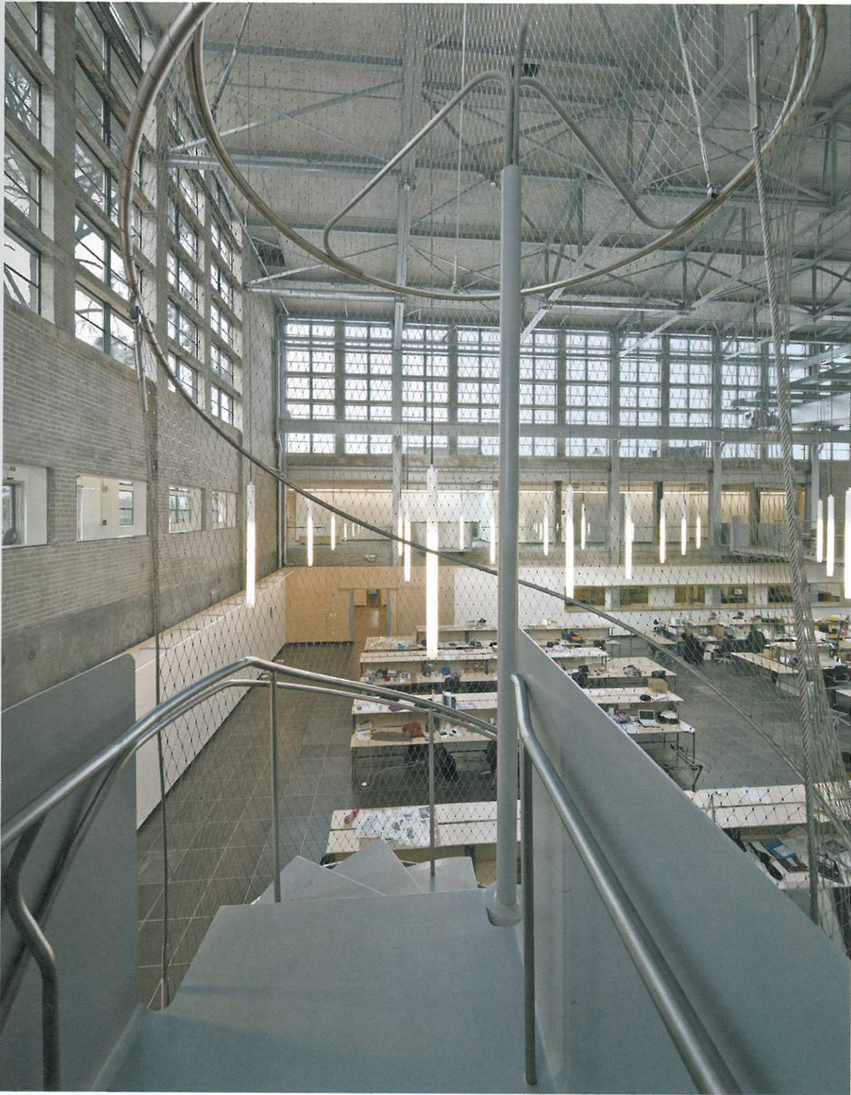
All images, unless otherwise noted: NADAA in collaboration with Lord, Aeck & Sargent, Hinman Research Building renovation, Georgia Institute of Technology, Atlanta, Georgia, 2011.